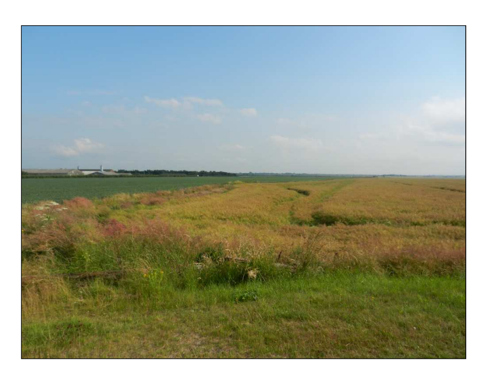
Fig. 4 View east across Goxhill 'Marsh' from the area between West Marsh lane, Goxhill and New Holland. Modern clay-tile works centre left.

Clearly throughout the middle ages, and possibly before, sections of discontinuous clay bank ramparts were constructed to hold back high tide waters from sections of the coastal marsh. Thereby Man could begin to adapt the estuarine lowland landward of the coastal defence. Such constructions, although presumably modest in size compared with those of the 20<sup>th</sup> century, must have then required considerable manpower and collective resources.