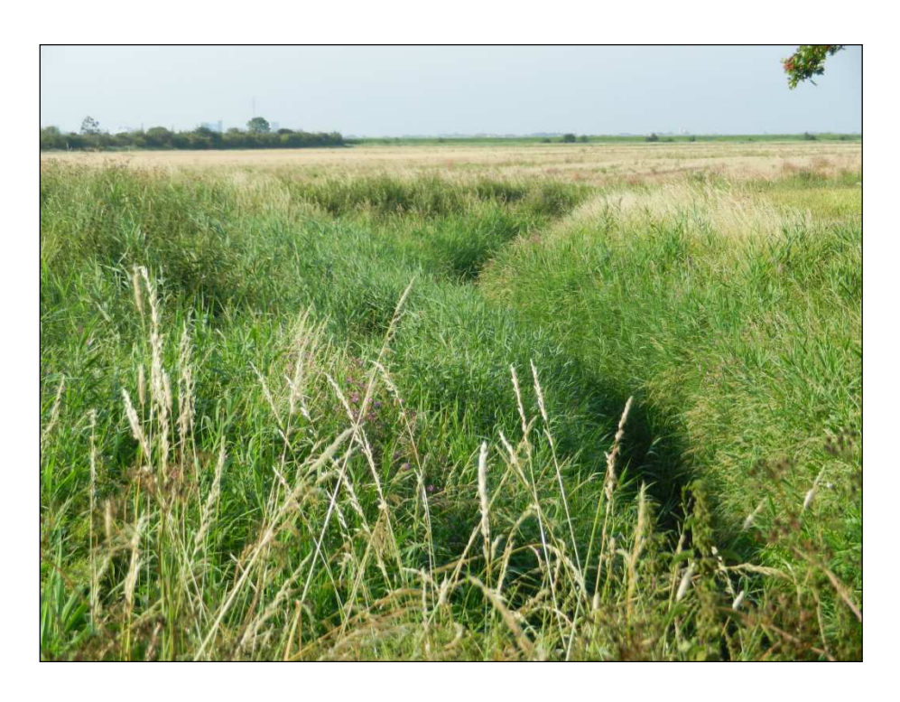
Fig. 6 Between Neatgangs Road and the sluice the stream (Goxhill Beck) that once separated three areas of Goxhill's pre-Enclosure common land (see Fig. 1) retains its meandering course.