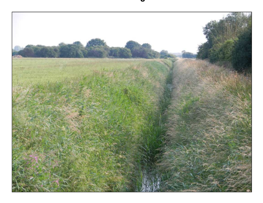
Fig. 7 Between Neatgangs Road and North End, Goxhill the Beck was 'canalised' as part of the Enclosure process.

Etymologically the words 'ings' and 'marsh' are of Scandinavian origin, the former meaning low lying pasture or meadow, the latter meaning meadow land lying near water and, possibly implying, periodic inundation. These terms (and Neatgangs, see above) suggest that the coastal lowlands had an