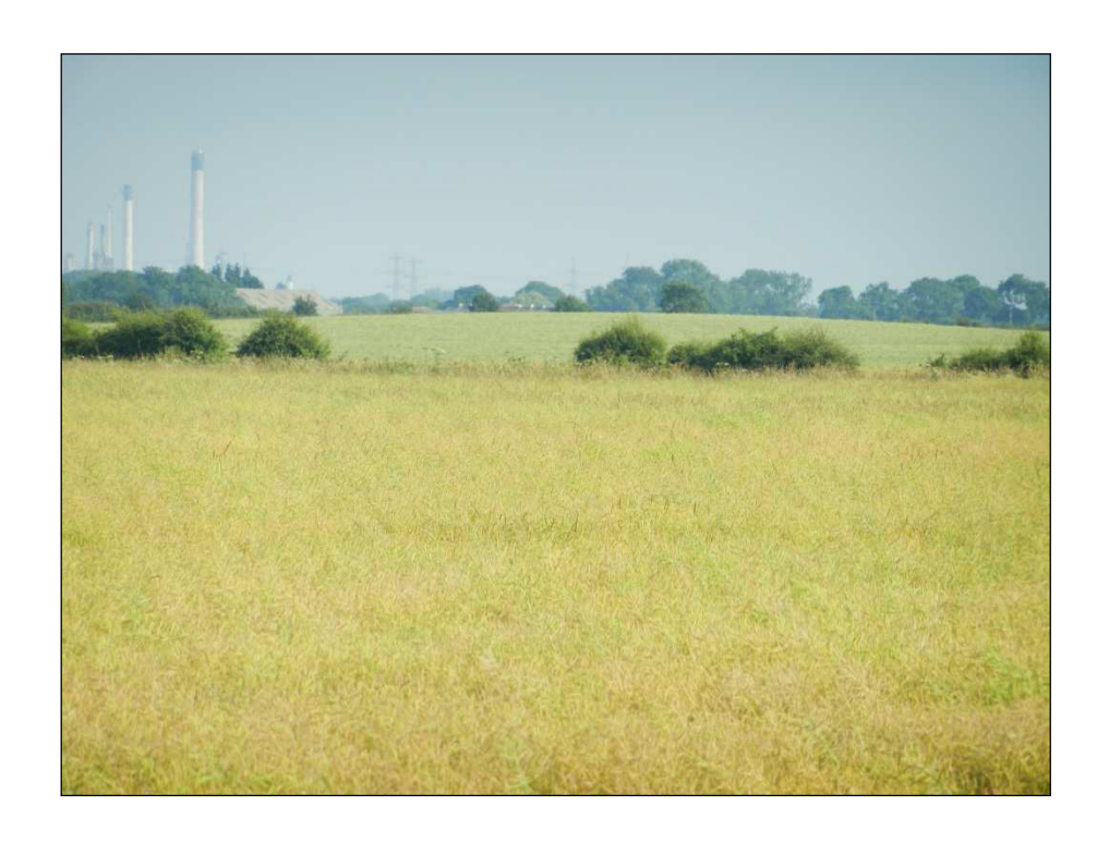
Fig. 3 The 'island' in the 'Marsh' in the Langley area of Goxhill parish (see Figs. 1 and 2.

The British Geological Survey map (see above) shows an almost exact correlation between the area of the south Humber estuarine alluvium and the area utilised as medieval common land across the three parishes. However, apart from the estuarine inlets, another intrusion into the estuarine alluvium was two 'islands' of till (see Figs. 2 and 3), the larger of the two being a low, linear drumlin still visible in the landscape between Ferry Road and Horsegate Field Road, Goxhill. Prior to the impact of Man these would have literally been islands surrounded by brackish marsh. The second 'island' of till now makes no impact on the level landscape between West Marsh Lane (Goxhill) and New Holland (see Figs 2 and 4), this probably a result of having been 'ploughed down' by decades of arable farming.