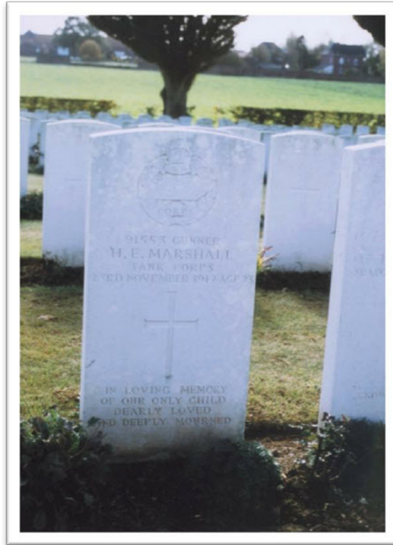
Fig. 5 A colleague of the Tank Corps who didn't make it.

On 29 th November General Elles inspected the surviving British tanks drawn up in Havrincourt village; across the preceding week 188 officers and 965 other ranks had been killed from the nine Tank Battalions.