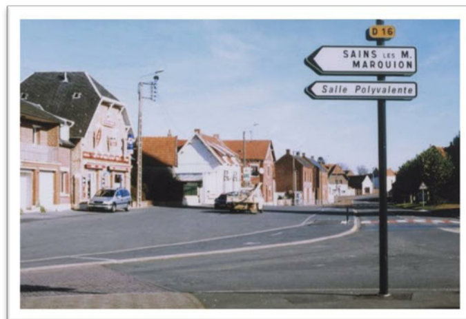
Fig. 6 The centre of Bourlon village – 'Place de les Combatants Ancients'. The local church is sited just off the picture to the right.

On 29 th November General Elles inspected the surviving British tanks drawn up in Havrincourt village; across the preceding week 188 officers and 965 other ranks had been killed from the nine Tank Battalions.