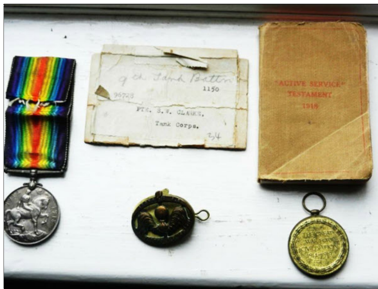
Fig. 2 Items retained in the kitchen sideboard.

centre top the medal box, the most informative item. The final item is a French cap or lapel badge – so far I have been unable to discover its origin.