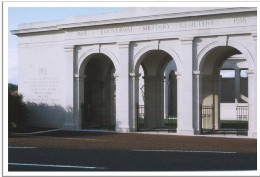
Fig.9 Louveral Military Cemetery, commemorating the 7000 soldiers who died at the Battle of Cambrai 'Without mortal remains'.

In early December 1917 the Germans mounted a counter offensive along the salient in blizzard conditions and across ruined villages, scared woods, wrecked tanks and trenches.