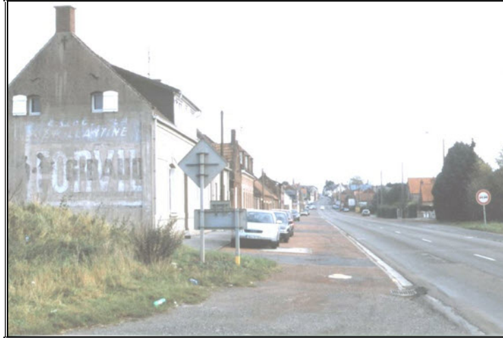
Fig. 7 The main street of Fontaine notre Dame.

The definitive study of the Battle of Cambrai is Bryan Cooper's, 'The Ironclads of Cambrai, the First Great Tank Battle', published 1967 by Cassell (Cassell Military Paperbacks). He used many different sources of evidence to build up a complete overview, whereas I have just used the Battalion diaries of the 9 th Tank.