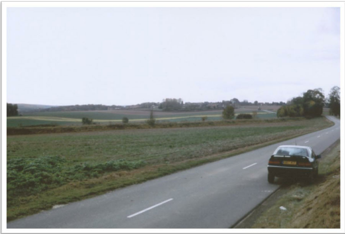
Figure 4 Havrincourt village in the middle distance with Havrincourt wood just beyond. View south-west from the Flequires – Havrincourt road.

By 19th November the 9th Tank Battalion had been entrained to Havrincourt Wood where the tanks laid in wait under cover. At 6-30a.m. on Tuesday 20th November the engines were fired up and by 9a.m. most had crossed two miles of undulating farmland towards Bourslon village in the direction of the Hindenburg defences. By evening 199 tanks had made it back to Havrincourt Wood, the Hindenburg Line having been breached but not broken. The following day the government back in London ordered church bells to be rung throughout the land, a premature celebration. There were no further frontal attacks on the Line but on 23rd November, in snow and rain, the sub battle of Bourslon Ridge began.