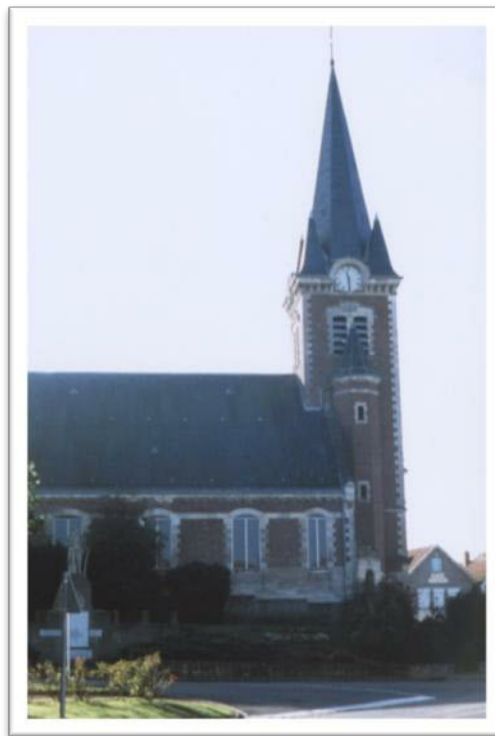
Fig.8 Bourlon church.

The definitive study of the Battle of Cambrai is Bryan Cooper's, 'The Ironclads of Cambrai, the First Great Tank Battle', published 1967 by Cassell (Cassell Military Paperbacks). He used many different sources of evidence to build up a complete overview, whereas I have just used the Battalion diaries of the 9 th Tank.