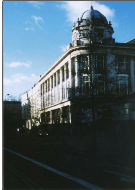
Figure 1 Whiteley's store building today with external features much as they would have been during and after the Great War. Imagine Sidney on his delivery cycle setting out along Bayswater Road.

At some point he gained employment as an errand boy/ person for Whiteley's store on the Bayswater Road, near Hyde Park. Whiteley's was one of the early general stores and perceived as very high class. The original exterior remains, the inside being a modern shopping mall. One of its most famous features was an elegant, flowing central staircase leading to the first and second floors and below a glass roof dome, both of which survive. The current owners have no staff records going back to 1914.