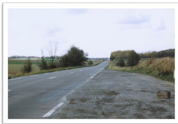
Figure 3 View west along the Bapaume Rd., Bourlon Wood to the right, Graincourt to the left, Fontaine notre Dame behind the camera. This is part of the land across which tanks of the 9 th Battalion travelled.

I am sure that when I was a child father made occasional references to the Battle of Cambrai, I didn't then know of its significance. The battle was the first in which the British deployed large numbers of tanks and as it took place in late November 1917, this presumably being his first big engagement. The battle plan was to use 378 tanks to spearhead the advance followed by the infantry in an advance that would breach the Hindenburg Line of German Western Front defences and capture back the French industrial city of Cambrai. My research initially involved visits to Kew to gain a detailed knowledge of what the 9th Tank Battalion did, this followed by a trip to north-east France to explore the specific locations.